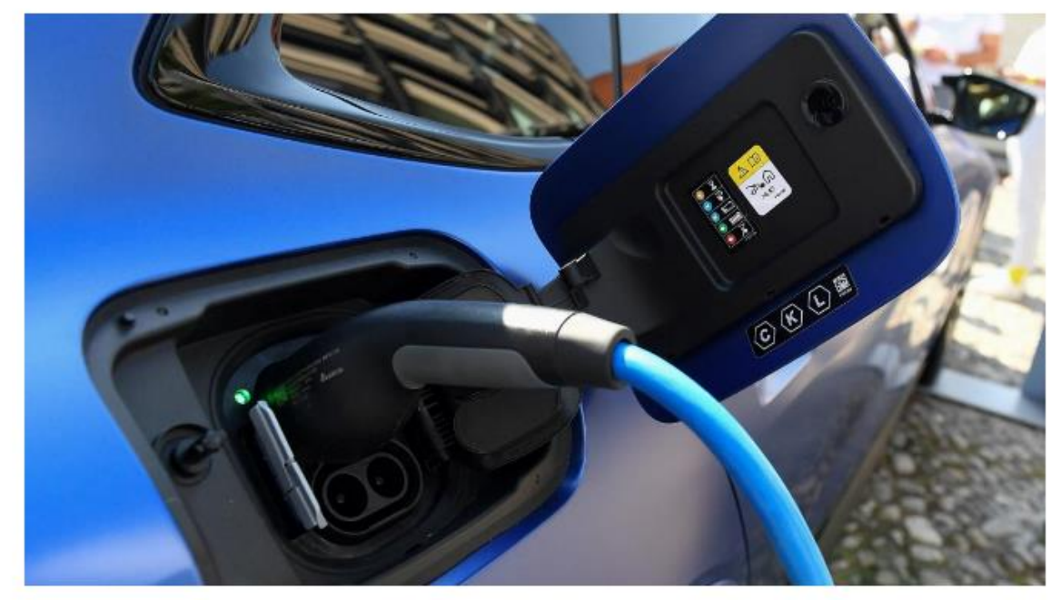
There are 300,000 battery electric vehicles on the UK's roads, but this could rise to 14 million by 2030

Sunday September 12 2021, 12.01am, The Sunday Times